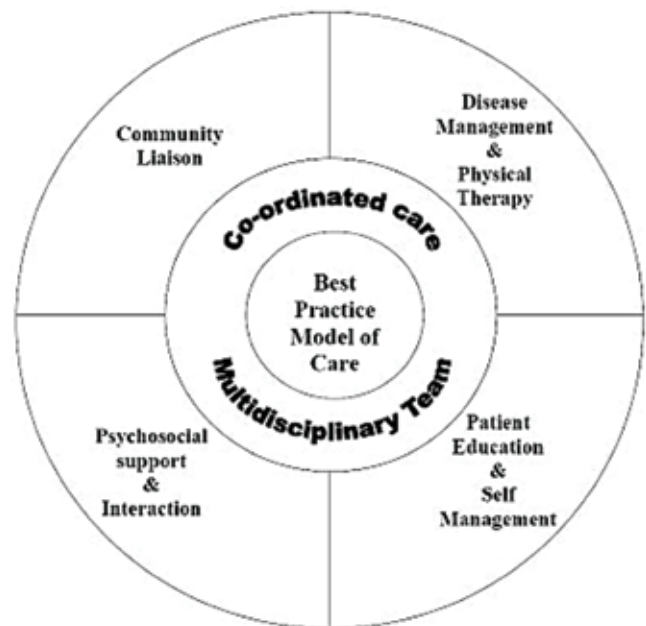
Figure 2: Paediatric Rheumatology Best Practice Model of Care, Royal Children's Hospital, Melbourne

A new model of care for paediatric rheumatology nursing has also been proposed, although to date, there has been no progress in its implementation. Under the proposed model, paediatric rheumatology nurses would progress to nurse practitioners whose role would include disease management and advanced clinical assessment, with authority to order radiology, pathology, prescriptions and referrals. Nurse practitioners would be able to practice autonomously, for children and adolescents treated with NSAIDs or in clinical remission, and to co-manage with paediatric rheumatologists in more complex cases. 6